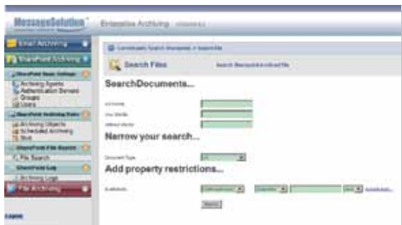
SharePoint Search Files