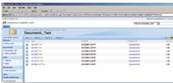
SharePoint Web Page