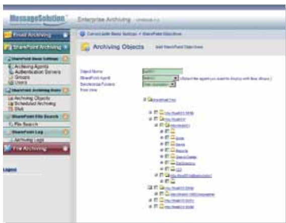
SharePoint Archiving Objects