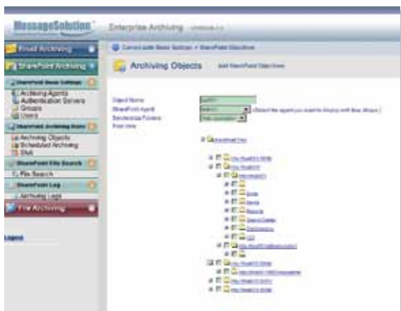
SharePoint Archiving Objects