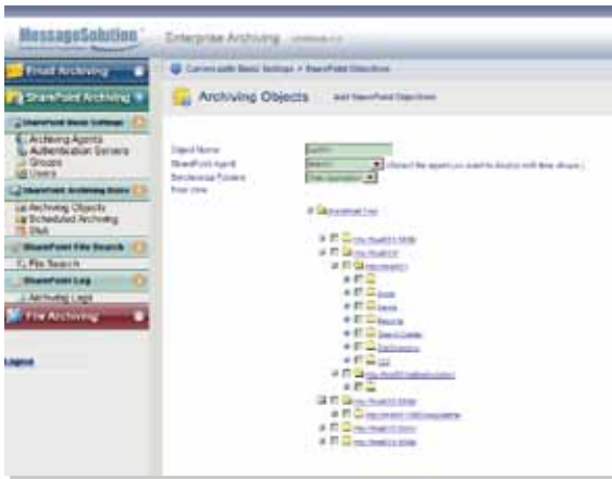
SharePoint Archiving Objects